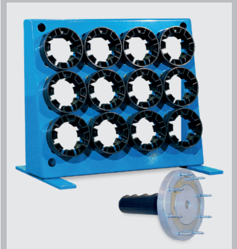
Tool base and Tool rack with QuickChange-tool as an option.