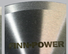
Smooth blade as an option.

FURTHER INFO ON OPTIONS, PLEASE REVERT TO SPECIFIC PRODUCT CARD