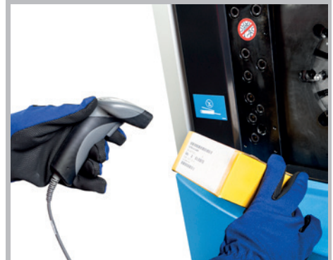
Bar code reader as an option.