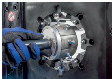
Die sets can be installed into the master dies with a QuickChange-tool one set at a time.