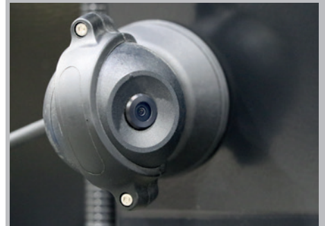
Camera as a standard feature.

Oil Condition Monitor OCM Safety scanner Adapter dies (for 160-series die sets)