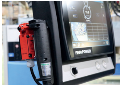
Remote control unit as a standard feature.