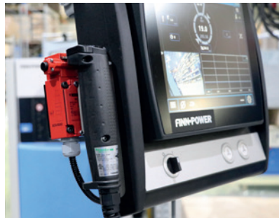
Remote control unit as a standard feature.