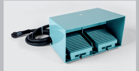
Foot pedal as an option (factory installation only).