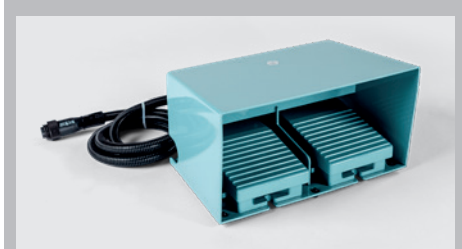
Foot pedal as an option (factory installation only).